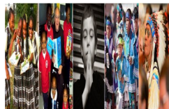
SUPPORT THE BLACK AND INDIAN MISSION COLLECTION